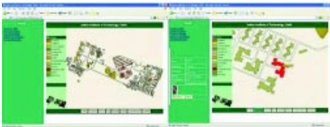
Screenshot of Web Based GIS Tool for IIT Infrastructure Information System

A sample screenshot of the web based GIS tool is depicted here.