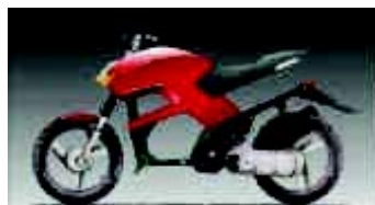
CVT MOTORBIKE DESIGN on Hero Winner Platform.