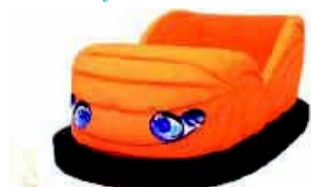
Styling of Striking Car