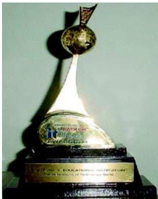
Best IT User Award to IIT Delhi