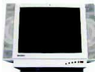
Design of a 21" Flat CTV in Indian Scenario