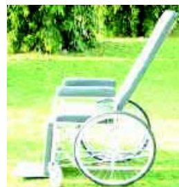
Wheel chair for paraplegic patients.