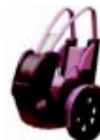
A side car for the Hero Honda