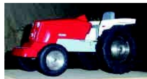
Styling of Tractors